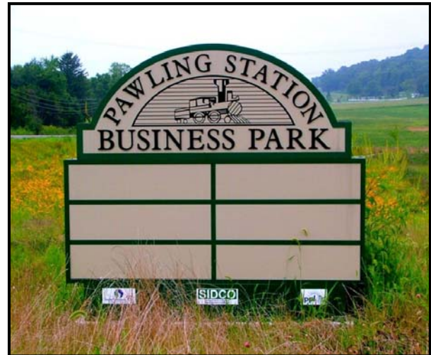
Pawling Station Business Park, Penn Township, Snyder County. This is the first site in Snyder County to take advantage of the KOZ program.